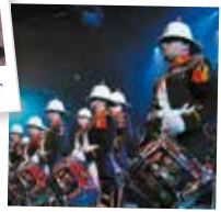
Shows & Events