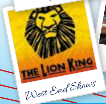
West End Shows